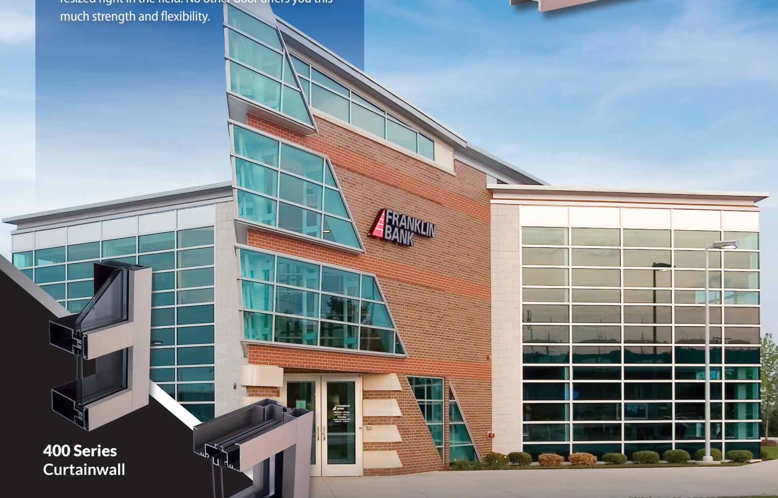
400 Series Curtainwall